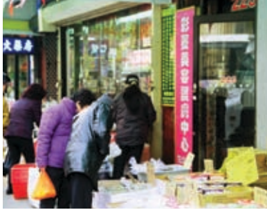
The first major settling place for Chinese immigrants on the East Coast, the Lower East Side's Chinatown remains one of the largest, most active Asian gathering points in the world.

M ore than 200 years ago, extended families from around the world pursued the American Dream by coming to New York and living on the Lower East Side. A place where dreams materi-