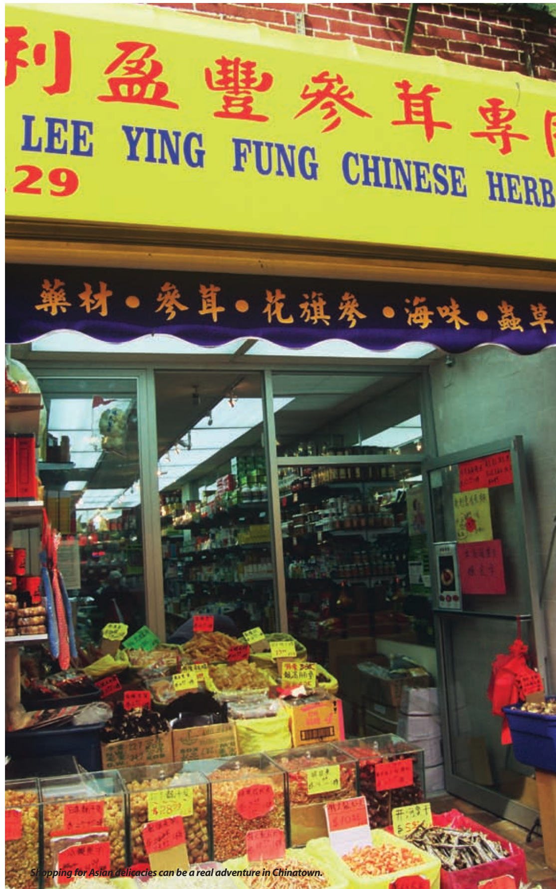
Shopping for Asian delicacies can be a real adventure in Chinatown.

Calypso Home , 199 Lafayette Street 212.925.6200