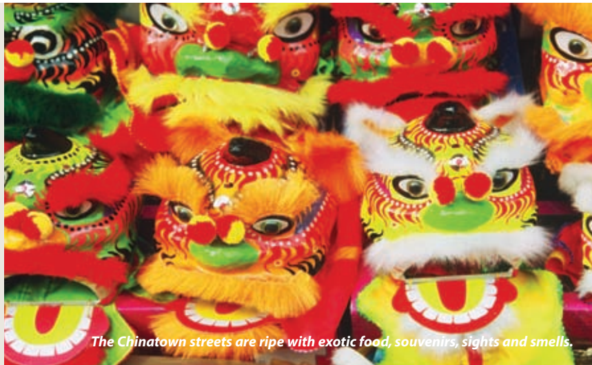
The Chinatown streets are ripe with exotic food, souvenirs, sights and smells.

The first Chinese immigrants were primarily railroad workers who came from the West in the 1870s to settle in a limited section of the Lower East Side. Chinatown came to be in the late 1880s when male Chinese immigrants settled in a small section of tenements on the lower end of Mott Street, as well as nearby Pell and Doyer Streets. For nearly a century, anti-immigration laws forbid most men to have their families join them, making the neighborhood a “bachelor society” with a static population. At the end of World War II, Chinese immigration quotas were increased, bringing about neighborhood expansion. New arrivals continued to pour into this noisy, crowded area to live and work, and now Chinatown is as lively as ever, filled with souvenir shops and authentic restaurants in pagoda-style buildings.