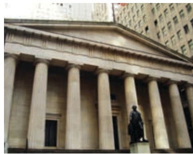
The temple-fronted New York Stock Exchange at 20 Broad Street, the world's largest securities marketplace exhibit hall, features panoramic displays dramatizing the Wall Street story for visitors.

A neighborhood full of striking beauty and contrasts, the Financial District and Battery Park City are defined by their connection to the history and future of New York. A place where