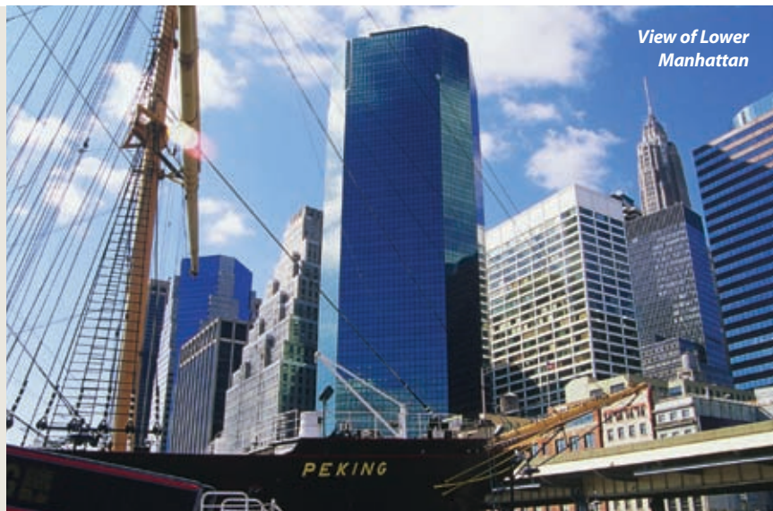
View of Lower Manhattan

It was here that the Dutch established the colony of Nieuw Amsterdam in 1625. Dutch settlers built shelters and a fort to protect themselves from the Native Americans, who were initially friendly but later turned hostile. Fort Amsterdam, the original fort, was renamed when the British took over, then torn down in 1789 to make way for the Government House, a building intended as the residence for the nation's President. Since New York's hopes to become the nation's permanent capital city did not come to pass, Government House became the state governor's mansion until the state capital was moved to Albany in 1796.