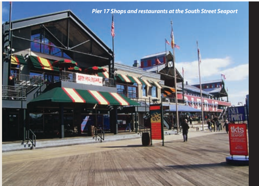
Pier 17 Shops and restaurants at the South Street Seaport

South Street Seaport Formerly a bustling seaport in the 18th and 19th centuries, the area is now a thriving waterfront community complete with a world-class maritime museum, newly-restored buildings, breathtaking views, plus more than 100 shops, cafes and restaurants.