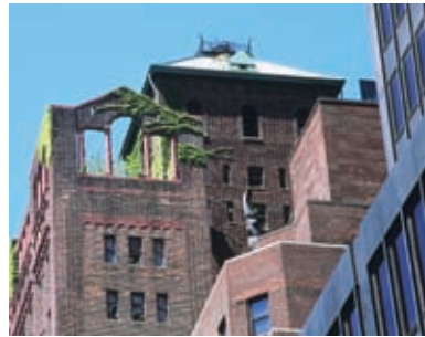
Apartment buildings, which shot up throughout the late 19th century, were key to the gentrification of the area. Real estate developers invested in grand projects, and the avenues began to develop distinct characters

R ich with cultural opportunities, egalitarian pleasures, and neighborly residents who enjoy Manhattan life, the Upper West Side is a destination for all ages. Though it may have been