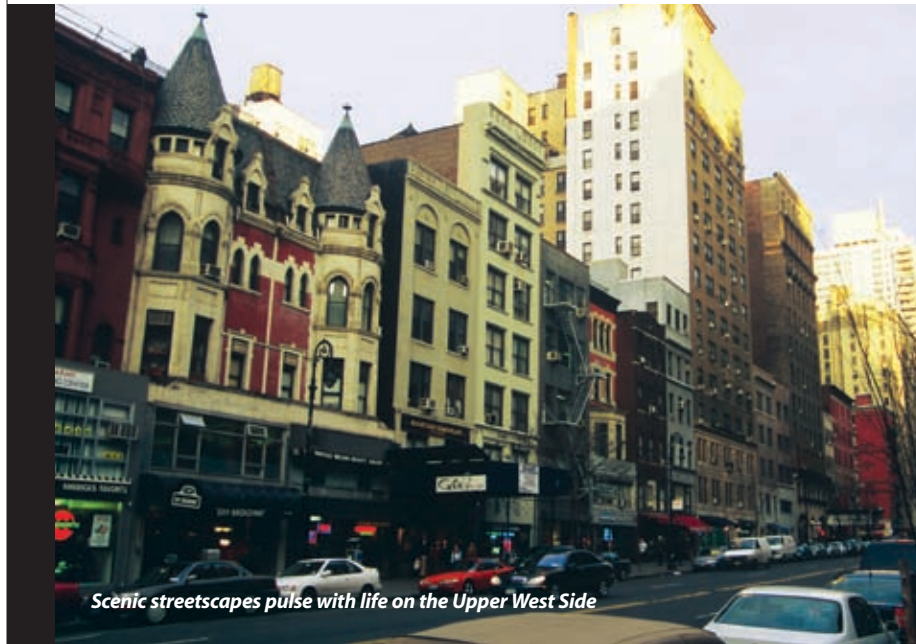
Scenic streetscapes pulse with life on the Upper West Side

Tavern on the Green , Central Park at West 67th Street, is Warner LeRoy's lavish restaurant in Central Park, with different dining rooms featuring different themes. There's jazz and cabaret in the Chestnut Room, and a view of