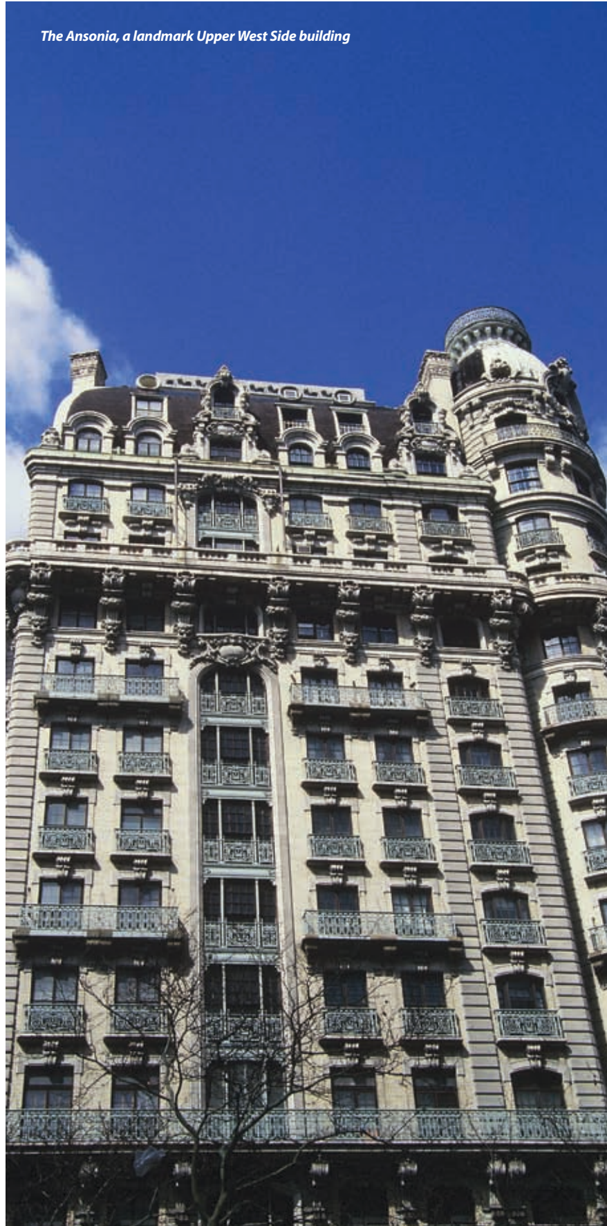
The Ansonia, a landmark Upper West Side building

Riverside Park , 72nd to 159th Streets between Riverside Drive and the Hudson River. Long and narrow, tree-lined Riverside Park was laid out by Central Park designers Olmsted and Vaux between 1873 and 1888. Riverside Park is more manageable than Central Park, and best visited on weekends, when Upper West Side residents and their children fill its walkways. A statue of Eleanor Roosevelt stands at the park's entrance at 72nd Street and Riverside Drive. The 79th Street Boat Basin is a rare spot in the city where you can walk right along the river's edge and watch houseboats bob in the water. The Rotunda is a great spot for snacks, drinks and river views. Walk the Promenade, a broad formal walkway, north to 80th Street to find a community garden with flowers tended by nearby residents. An imposing 96-foot-high circle of white marble columns towers at Riverside Drive and 89th Street – the Civil War Soldiers' and Sailors' Monument, designed by Paul M. Duboy in 1902.