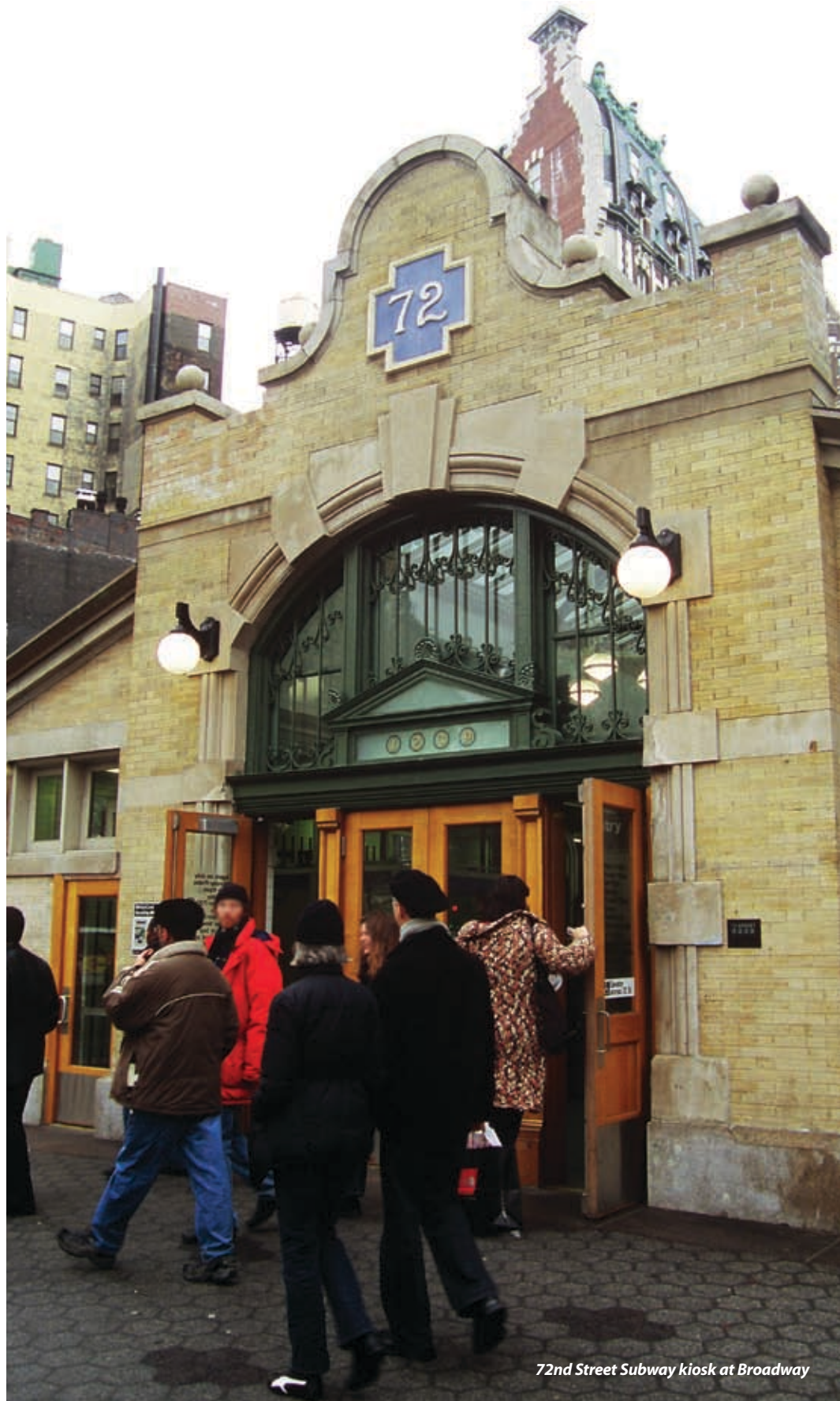
72nd Street Subway kiosk at Broadway

Gennaro, 665 Amsterdam Avenue between 92nd & 93rd Streets. The food here is worth the seemingly-endless-at-times wait and cramped tables. This tiny storefront trattoria has some of the city's best and most reasonably-priced Italian food. 212.665.5348