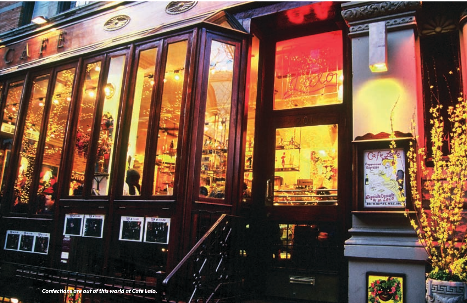
Confections are out of this world at Cafe Lalo.

Symphony Space , at Broadway and 95th Street, is a performing arts complex that recently underwent a huge capital improvement program. Facilities include the Peter Jay Sharp Theater and Leonard Nimoy Thalia just around the corner.